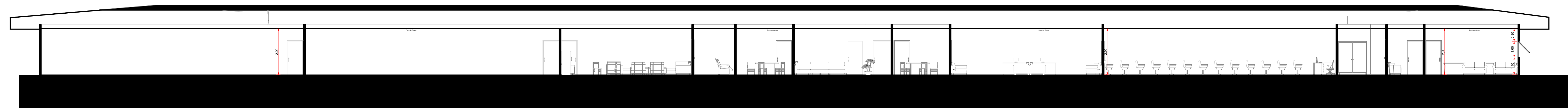
CORTE C-C 1:200